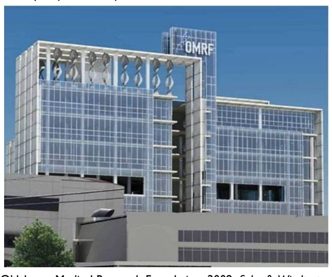
Oklahoma Medical Research Foundation, 2008 Solar & Windtecture