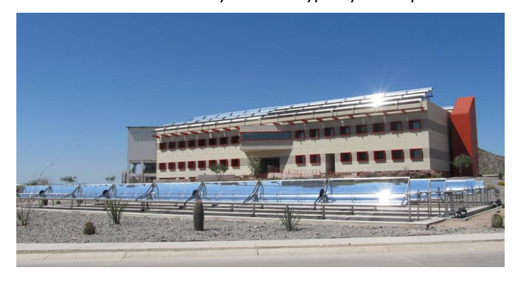
Solar Concentrator Chiller System, HOLCIM Mexico 2010-12

Design and installed cost of a Solar PV, Solar Thermal Concentrator or Wind System runs typically $2.20 per watt.